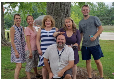
Each summer, the GHAPS team makes sure children from migrant families enjoy hands-on lessons, fun activities and balanced meals.