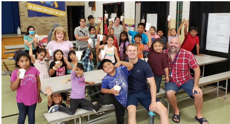
For our migrant students, the GHAPS community is a home away from home.