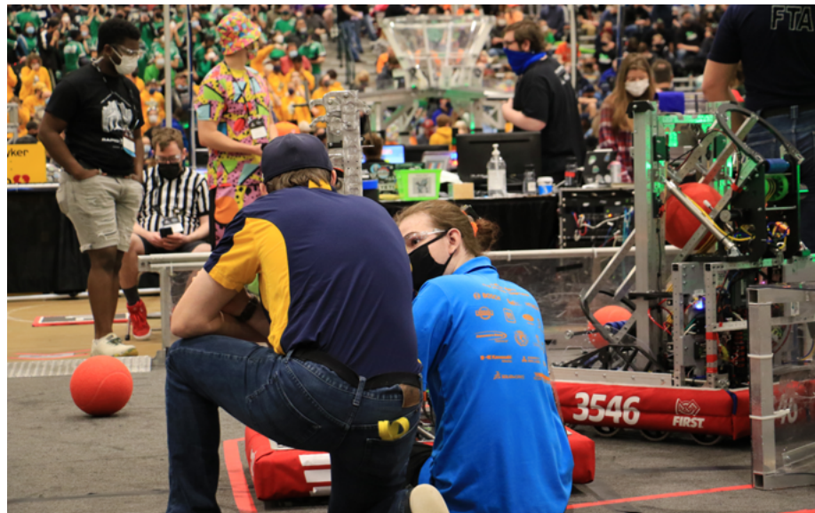
Focus, adaptability and teamwork are key during FIRST robotics events.

On March 19, the three Grand Haven teams returned to the Region 12 Championship event hosted by Grand Valley State University. GHHS claimed the Regional Championship title – its 28th since its first win in 1986. Lakeshore and White Pines earned first and fourth place, respectively, in the middle school